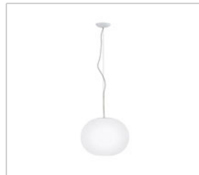
Glo-Ball S2 design by Jasper Morrison

Suspension lamp providing diffused light