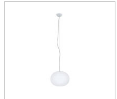
Glo-Ball S1 design by Jasper Morrison

Suspension lamp providing diffused light