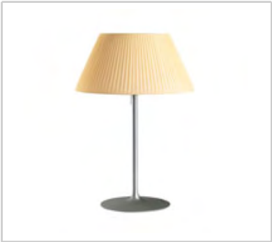
Romeo Soft T2 Touch Dimmer design by Philippe Starck

Table/desk lamp providing diffused light