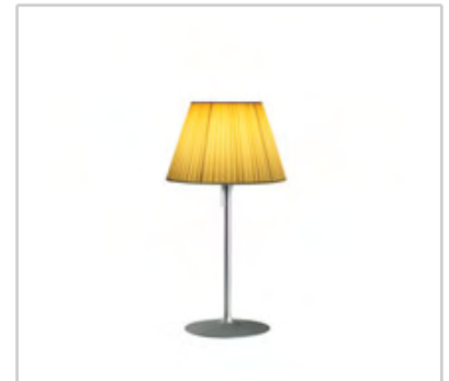
Romeo Soft T1 Touch Dimmer design by Philippe Starck

Table/desk lamp providing diffused light