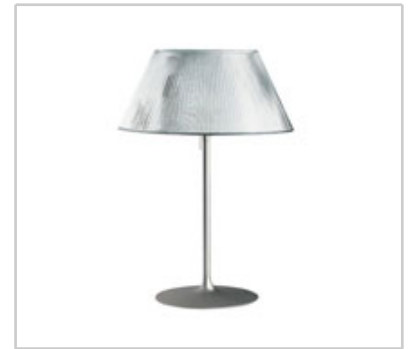
Romeo Moon T2 design by Philippe Starck

Table/desk lamp providing diffused light