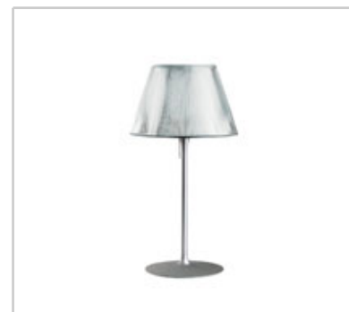
Romeo Moon T1 design by Philippe Starck

Table/desk lamp providing diffused light