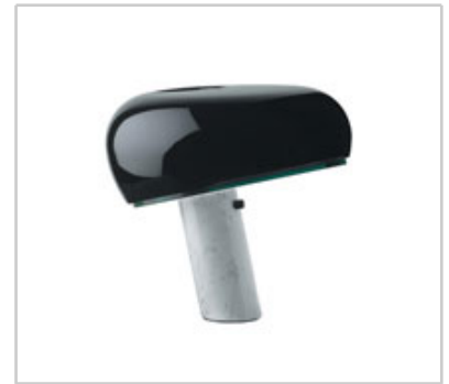
Snoopy design by Achille Castiglioni and Pier Giacomo Castiglioni